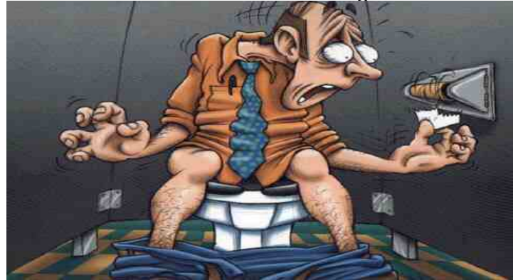
Only A Trucker Can Appreciate This Picture!