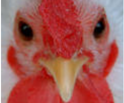
Before Swiss Chalet

See what are chicken drivers go through: