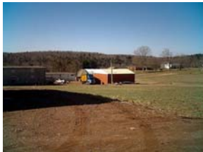
Arrive At Farm