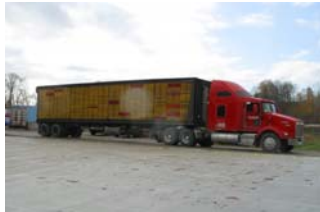
Chicken Trailer Ready