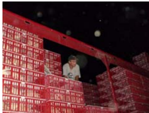
Driver Sometimes Load