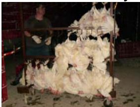
Chicken Brought To Truck