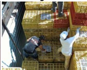
Sometimes Workers Help